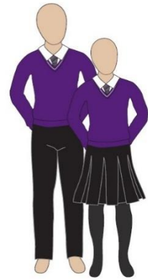
Years 7 - 9

At the Kingswood Secondary Academy we enforce our strict uniform policy rigorously. We believe that wearing our distinctive uniform gives our students a sense of belonging, helps foster pride in the Academy and stops students coming to school in inappropriate clothing or footwear. Students are our ambassadors in the community. Therefore, we expect all students to wear full uniform when travelling to and from the Academy, at all Academy functions, on extra-curricular visits and when taking part in sports events.